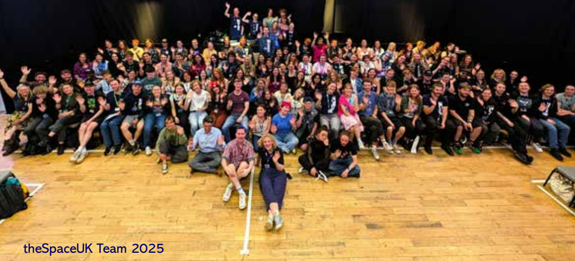
theSpaceUK Team 2025